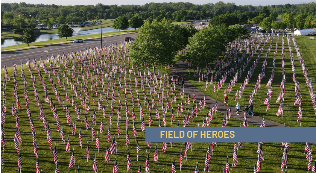
FIELD OF HEROES

More recently, the Westerville community pays tribute to veterans and active military with special events – such as the Field of Heroes over Memorial Day Weekend, Veteran's Day Breakfast, military banners lining Uptown, and events to support special veteran causes. Since 2009, Westerville has supported the mission of Honor Flight enabling over 850 senior veterans to travel to Washington, D.C. to visit their memorials.